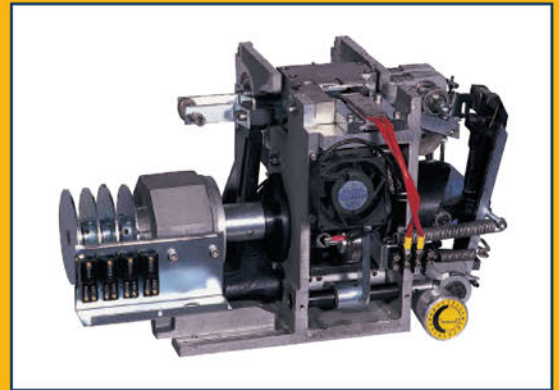
Automatic strapping head REISO1900