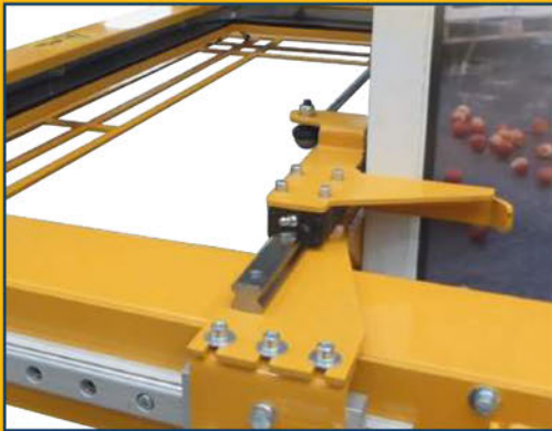
CRC Technology for a perfect placement of corners