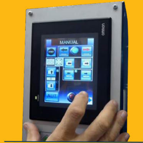
All settings available on touch screen control panel