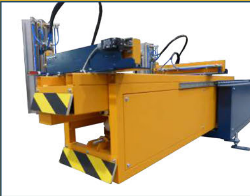
Automatic corner placer with pallet size detection